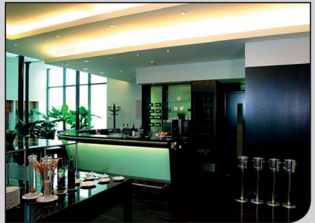
Interior restaurant design with TopSolid'Wood