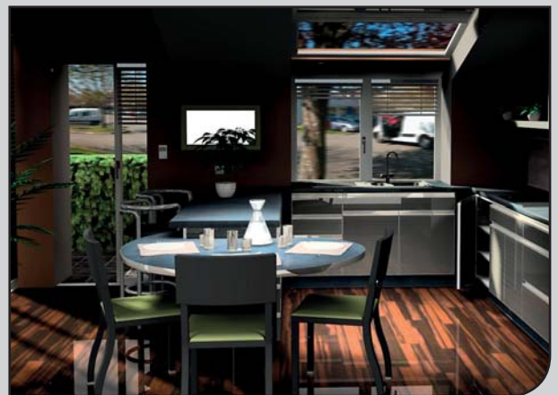
Kitchen design with TopSolid'Wood.