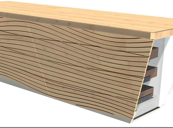
Drawer facades made with the new functions of TopSolid'Wood v6.16.