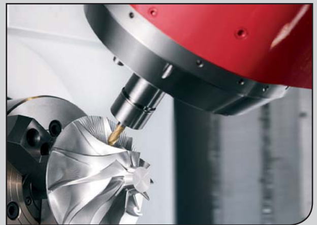
TopSolid'NCSIMUL provides a secure solution for complex machines.