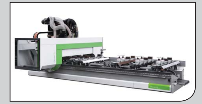
BIESSE ROVER B EDGE: CNC - Machining centres Routing Nesting Edgebanding.